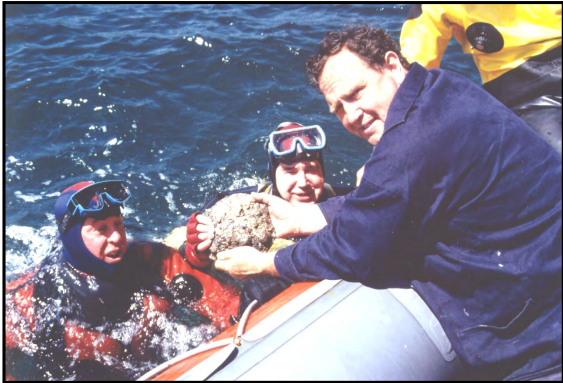
Members of the SWMAG team with the one of the ingots recovered from the site

Prepared for Historic England January 2018