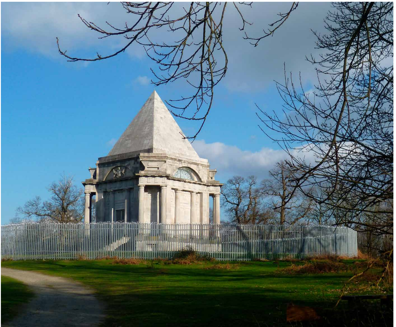
Figure 3 The Darnley Mausoleum, Cobham, Kent, 1783-6 by James Wyatt: one of the grandest of all neo-classical temples to the dead. Listed Grade I.

opulent private burial chambers, detached from churches and sometimes standing within private grounds, combining the provision of family burial space with imposing architectural structures; occasionally found from the mid seventeenth century onwards (as at Maulden, Bedfordshire; listed Grade II), they became more common during the Age of Neoclassicism, and sometimes assumed very imposing forms indeed. One of the finest is the Darnley Mausoleum at Cobham, Kent, built in the mid 1780s to James Wyatt's designs (listed Grade I; Fig 3).