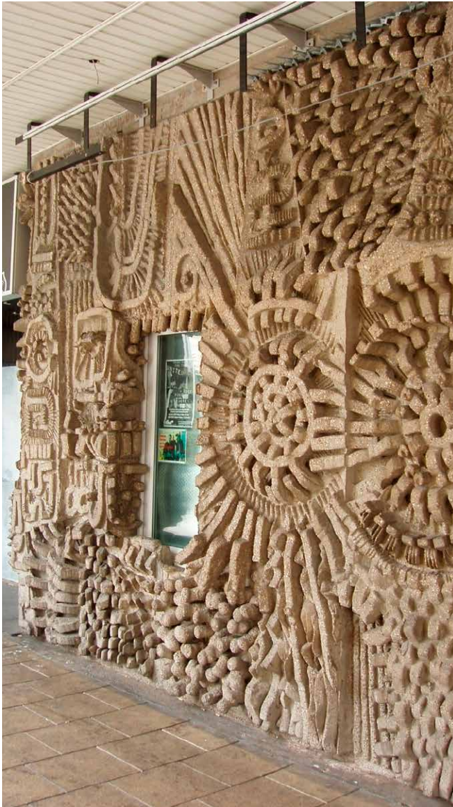
Figure 11 Public sculpture often enlivened post-war cityscapes: this relief (listed Grade II) of 1966 by William Mitchell graces the former Three Tuns pub in Coventry.

practical living memorials, such as village halls, pavilions or extensions to hospitals, as ways of remembering the dead. These foundations may incorporate inscription plaques, but are first and foremost buildings, and need to be judged for listing against the standards for the relevant building types. Sometimes these discrete parts can be listed in their own right, however, such as the name-covered archway of 1923 (listed Grade II) at the former Manor Hospital, London Borough of Islington.