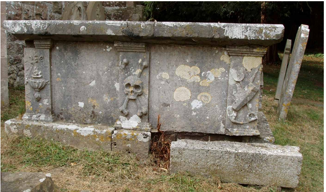
Figure 1 Chest tomb of Henry Wood (d.1630), Waterringbury, Kent, retaining symbolism and a notable epitaph. Listed Grade II.

Early modern outdoor survivals such as the elaborate Grade II listed chest tomb to Henry Wood (Fig 1) at Waterringbury, Kent, of the 1630s are of high significance for showing how the