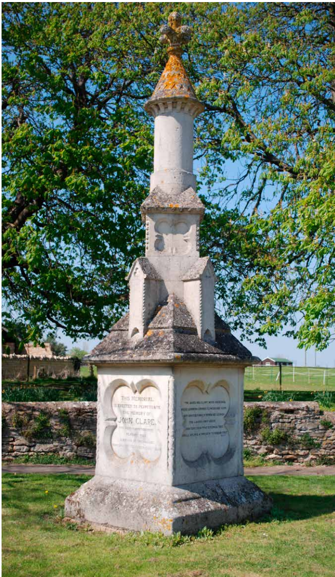
Figure 4 The 1864 monument to John Clare, 'Northamptonshire Peasant Poet', at Helpston, City of Peterborough. Listed Grade II.