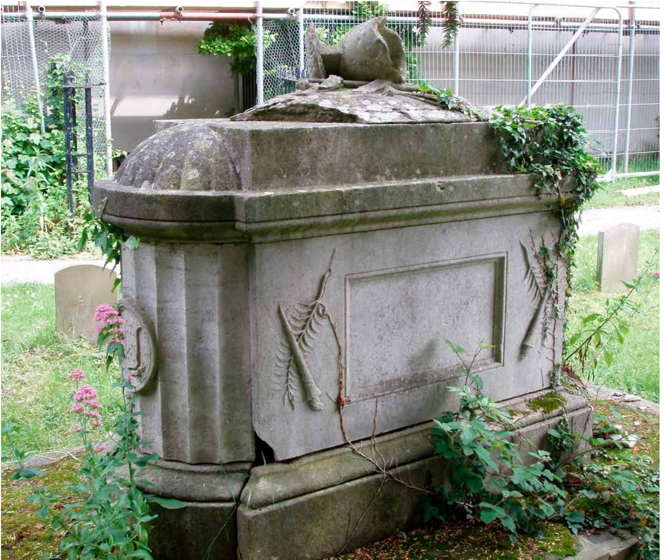
Figure 8 The Whyatt chest tomb in Egham churchyard, Surrey: notable examples of outdoor Georgian monuments will warrant listing. Listed Grade II.