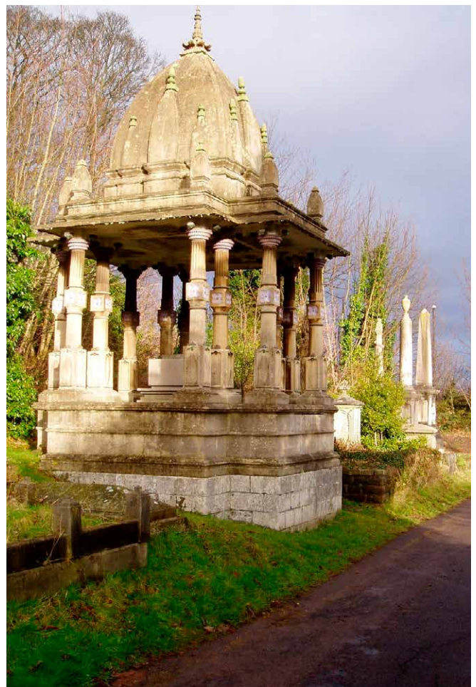
Figure 5 The monument of Raja Ram Mohun Roy, 1841, by William Prinsep, Arnos Vale Cemetery, Bristol. A notable example of Anglo-Indian design to a highly important reformer. Listed Grade II*.

Many nineteenth-century cemeteries are finely landscaped, the planting responding to contemporary thinking about the Picturesque and