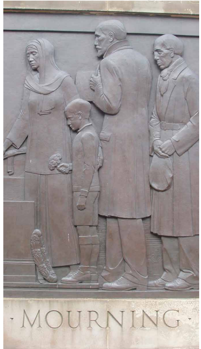
Figure 10 Detail from the bronze reliefs by Herbert Tyson Smith on the Liverpool cenotaph, St George's Plateau, Liverpool (unveiled in 1930). A high-point in commemorative twentieth-century sculpture. Listed Grade I.

realm could be, and what fitting tributes they sometimes were to the memory of the legion of dead. This has now been upgraded to Grade I. Unless compromised by alteration or of little design interest, there is a presumption in favour of listing all war memorials. Many memorials followed standard designs, such as Celtic crosses and calvaries. Nonetheless, such is the historic significance of these objects that listing will often still be warranted, particularly when inscriptions