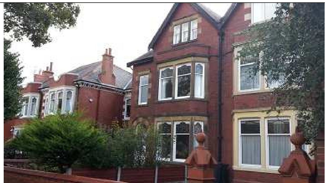
An Article 4 Direction has been put on the Lytham Avenues Conservation Area to require a planning application for any works to ensure that any alterations to the houses in this Conservation Area will be appropriate in style and in the use of materials