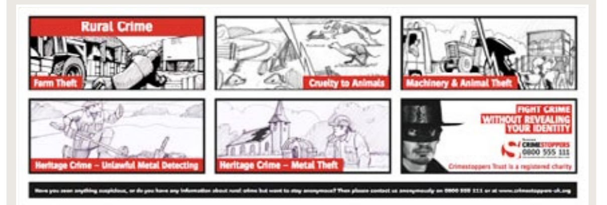
Above: Rural Crime storyboard

The storyboard will be distributed throughout Sussex and the video will be available online in the near future.