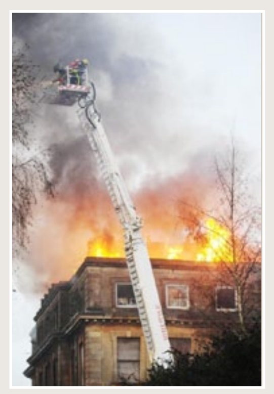
Above: Sandhill Park after the fire